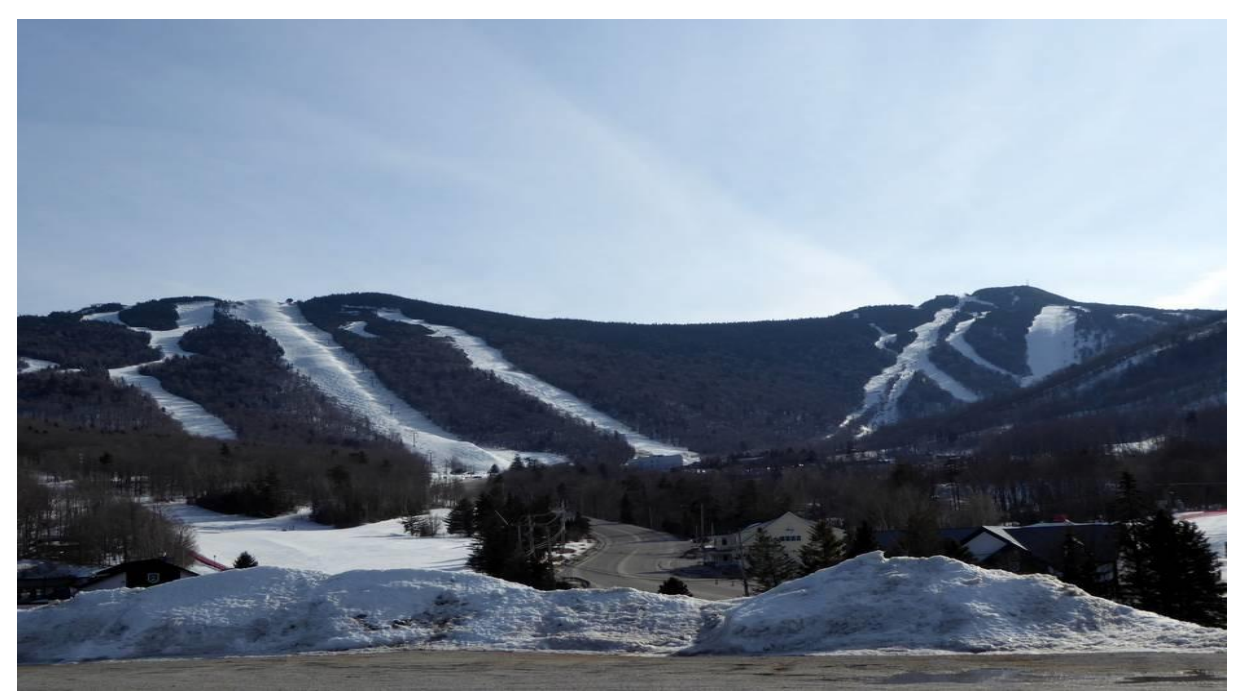
WELCOME TO KILLINGTON, VT SKI MIDWEEK......BEAT THE CROWDS SUNDAY TO TUESDAY JANUARY 21-23, 2024

This family friendly trip will begin meeting at Sunset Grocery Outlet at 9:00 am Sunday to load your gear, meet and greet your fellow travelers and hit the road at 10:00. Pack your snacks, lunch and beverages because Sunset is closed on Sundays. During our six-hour drive, games will be played, stories will be shared and, of course, a rest stop will be scheduled. The low cost of $539 per person (double occupancy) covers motor coach transportation, 2 nights lodging, 2-day lift tickets and daily breakfast at The Killington Mountain Lodge By Hilton. Ikon pass holders and non-skiers deduct $120. There are no senior or junior lift ticket discounts for this group trip.